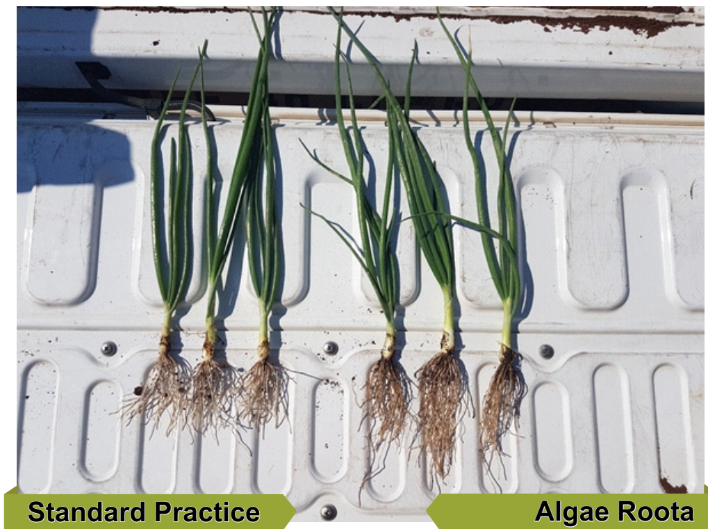
Photo taken on week 6 after emergence.